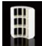
Ice separator (4 pcs.)