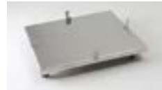
Stainless steel base (with casters) sold separately. 390mm x 390mm x 70mm