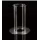
Ice removal bar